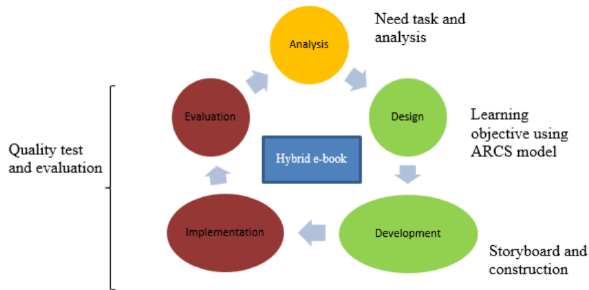
Figure 1: Hybrid e-book based on ADDIE model.