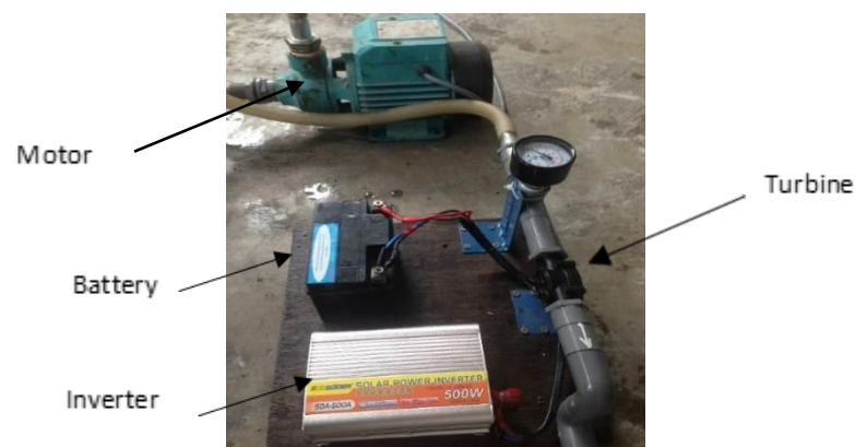
Figure 1: How to Generate the Power Generator

Figure 1 is the picture of connection hydroelectric. The result shows that the product was generate using water by the pump pressure. It was fully function if not using a water because the product have a battery. After using the product the battery is only 9.8V and the inverter does not release the output. The battery needs to recharge using the turbine and stored in the battery to remove the 12V DC output and then convert to 230V AC. We use water which at least has a pressure of 15 pSi to move the turbine so that it can be generated to get 12v output. It takes about 8 minutes 23 seconds to generate from 9.8V to 12.0V.